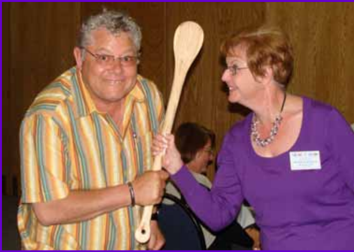
The Wooden Spoon being handed over with a "Threat and a Promise"