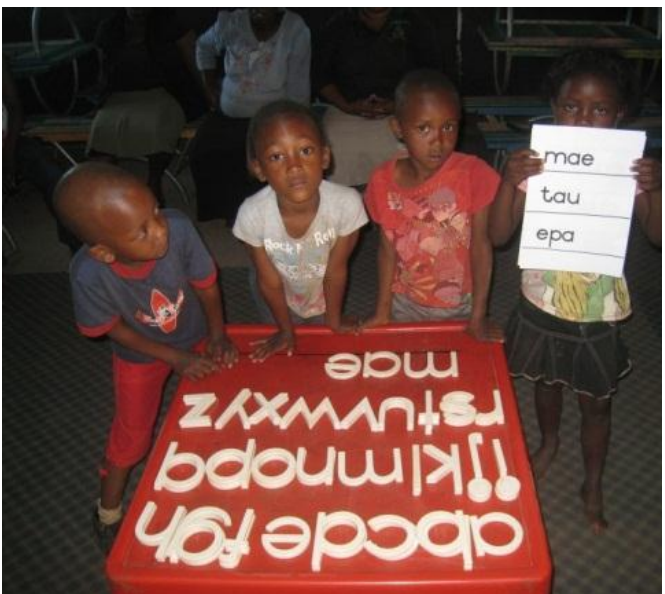
Step 2 - Writing phonic words