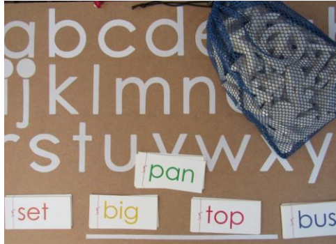
Step 1 - Learning the sound symbol link by ear, eye and touch

Step 2 is to build simple phonic words by "pulling The next step is to move on to reading the first out" the sounds of a word (building and writing book and here, the Club uses the books from the